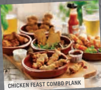
CHICKEN FEAST COMBO PLANK

CHICKEN FEAST COMBO PLANK £10.25 Piri-piri chicken wings, southern-fried-style goujons, crispy spicy chicken skewers, BBQ mini chicken skewers and bubble-battered chicken.