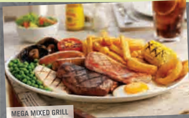
MEGA MIXED GRILL

Enjoy a large wine for 75p extra or a large Coca-Cola for 30p extra.