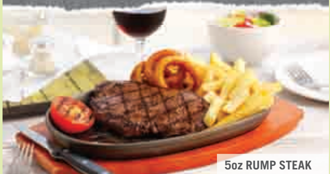
5oz RUMP STEAK

Ask your server for today's selection of sauces.