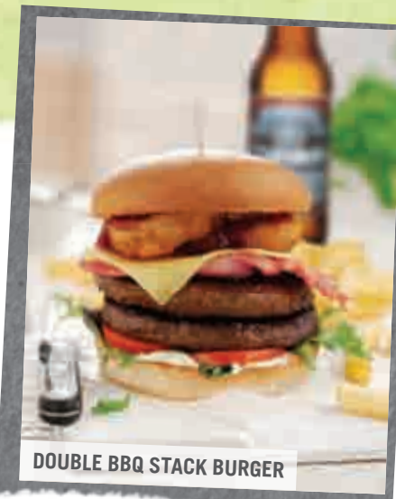
DOUBLE BBQ STACK BURGER

BBQ CHICKEN, BACON & CHEESE MELT BURGER £5.55