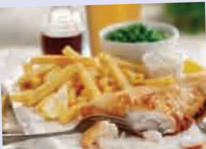
BEER-BATTERED COD, CHIPS AND PEAS