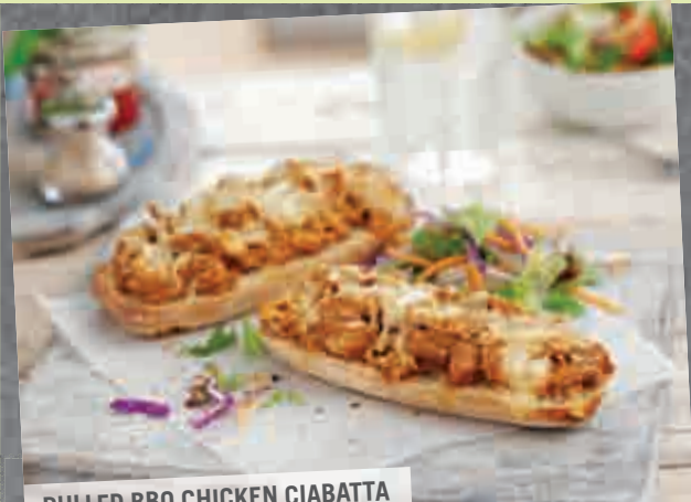
PULLED BBQ CHICKEN CIABATTA WHY NOT ADD SPIRAL FRIES FOR £1 OR CHIPS FOR 50P?