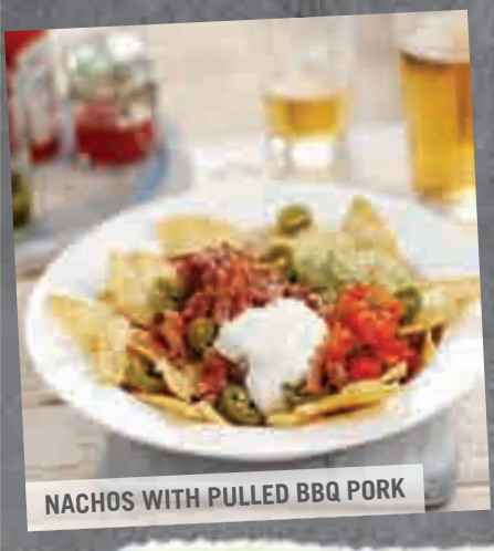
NACHOS WITH PULLED BBQ PORK

NACHOS £3.25 Topped with grated cheese, jalapeños, tomato salsa, guacamole and sour cream. ADD PULLED BBQ PORK £1.50