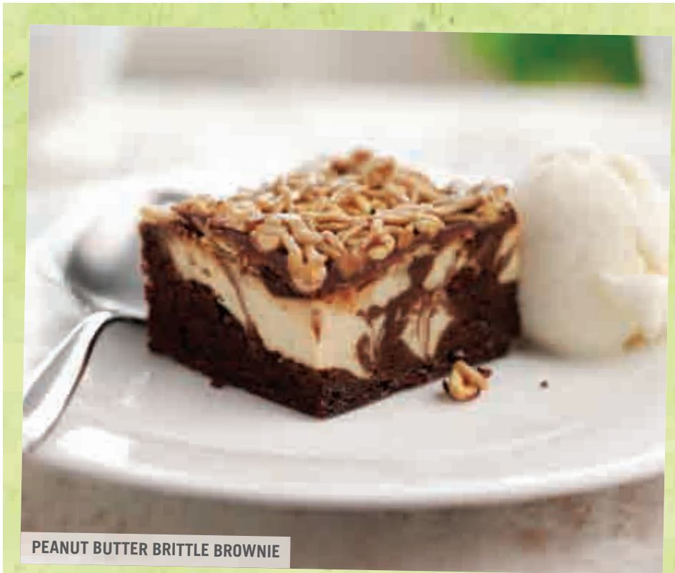
PEANUT BUTTER BRITTLE BROWNIE