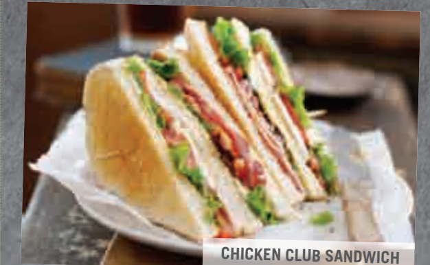
CHICKEN CLUB SANDWICH