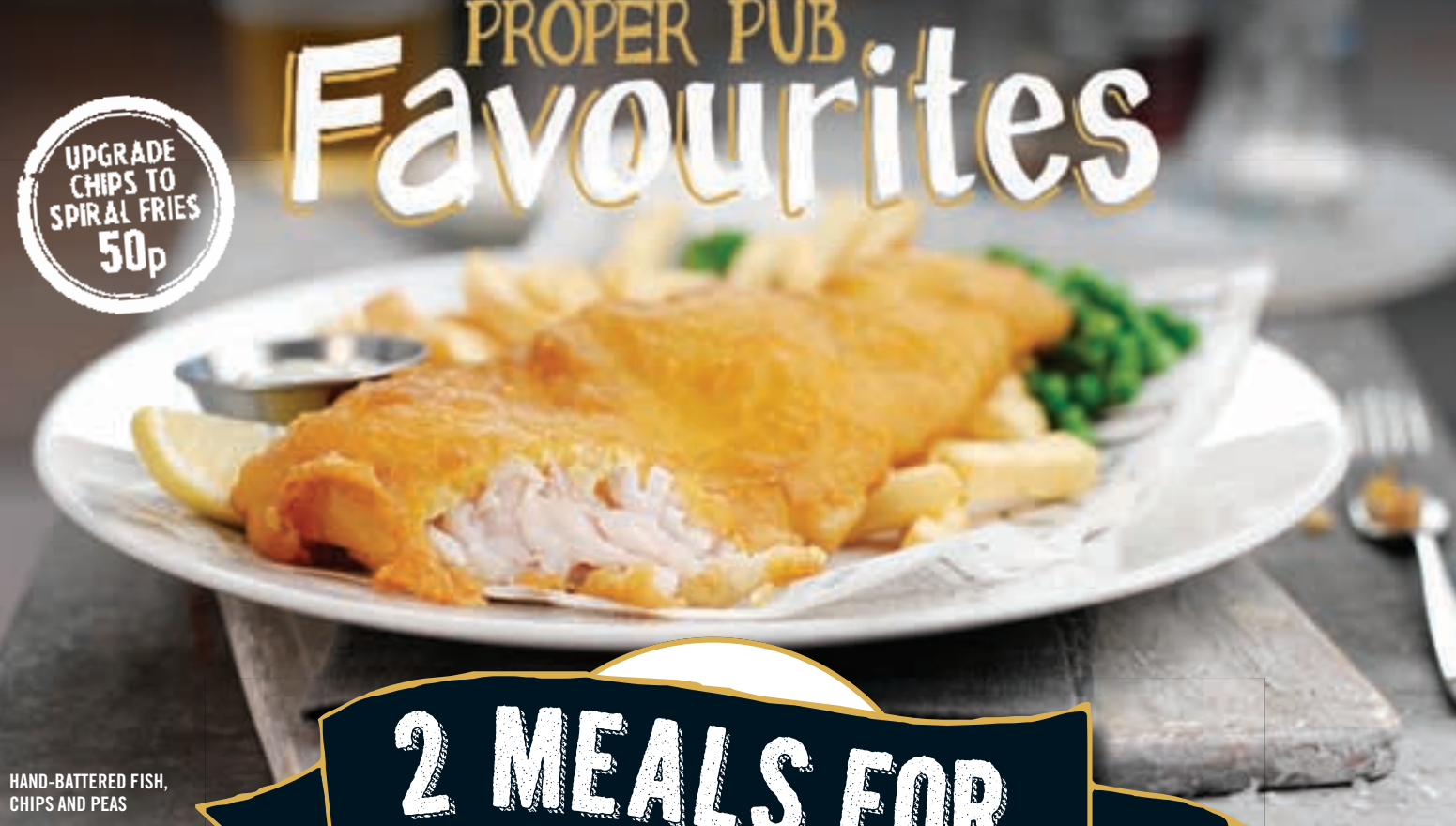
HAND-BATTERED FISH, CHIPS AND PEAS