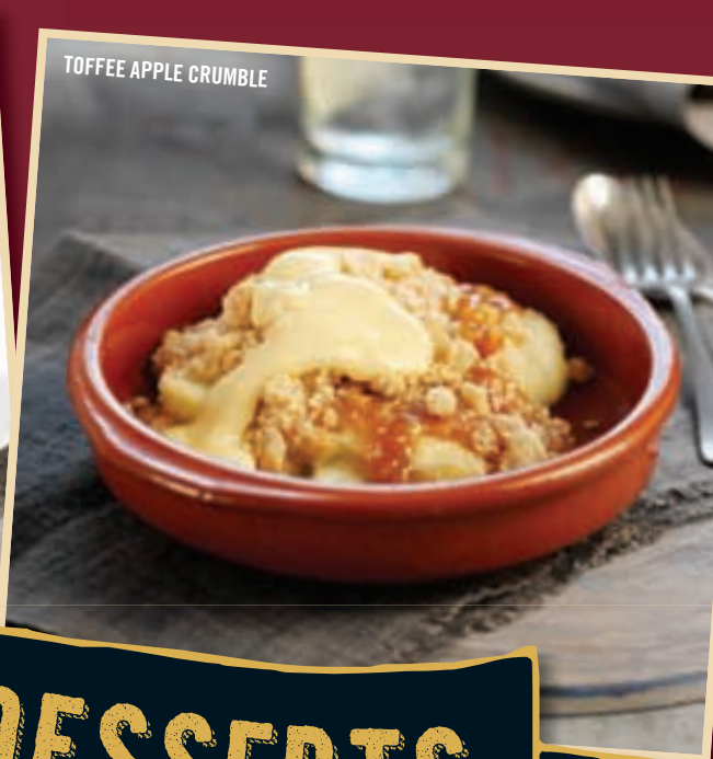
TOFFEE APPLE CRUMBLE