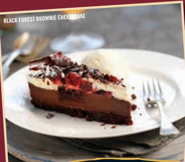
BLACK FOREST BROWNIE CHEESECAKE