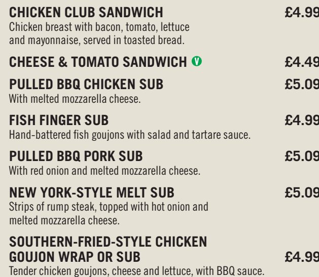
FISH FINGER SUB

50p UPGRADE FOR CHIPS AND £1.00 FOR SPIRAL FRIES