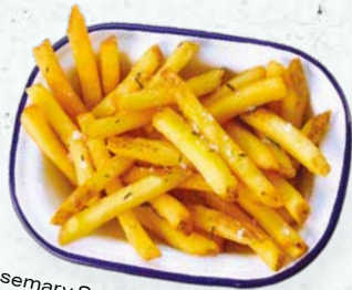
Rosemary Sea Salted Skin-On Fries V