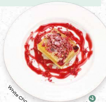
White Chocolate & Raspberry Blondie V