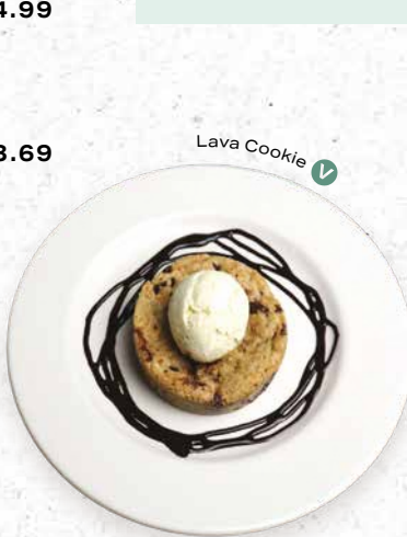
Lava Cookie V

with a tea (0 kcal) or Americano (2 kcal)