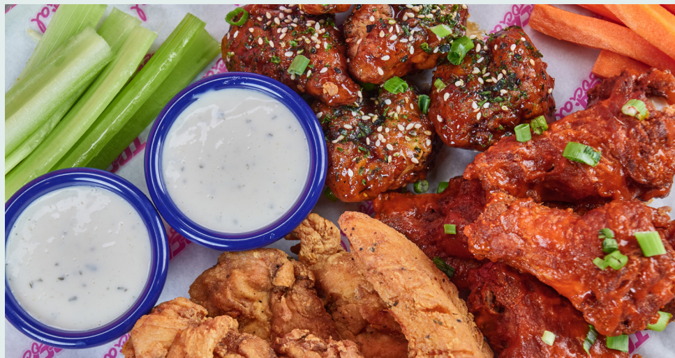
All wings and tenders served with your choice of ranch or blue cheese for dipping